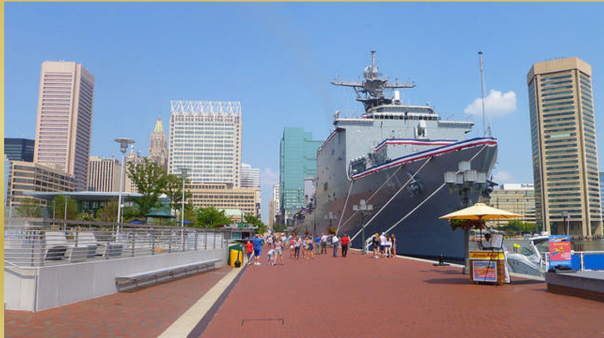
USS Whidbey Island LSD 41 – First of eight of the Whidbey Island Class of Ships.