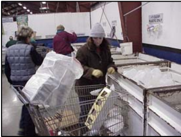
Customer Drop-Off at Navy Whidbey Recycle

• Navy Whidbey Recycle is also an industry leader in the area of in-vessel composting , generating high quality compost at its off-site composting facility, in operation since 2001.